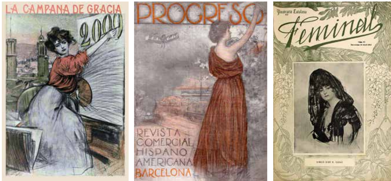
Figs. 2-4. In posters, postcards, illustrations and magazine covers like those shown here, the work of Ramon Casas, Júlia Peraire's face was abundantly reproduced in modernist Barcelona.

..... Júlia, the Painter. Cover of La Campana de Gracia , issue 2,000, published on 7 September 1907.