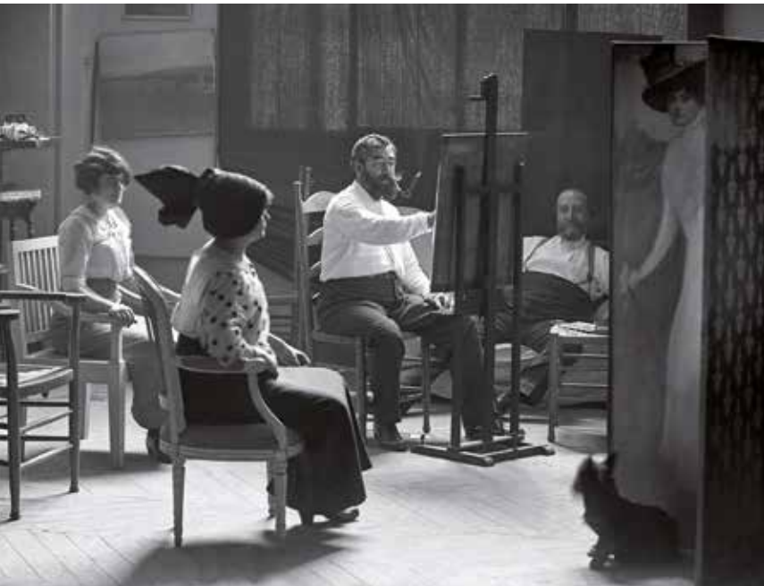
Fig. 6. This scene shows us a portrait session in Ramon Casas’ studio in Sant Gervasi, Barcelona.