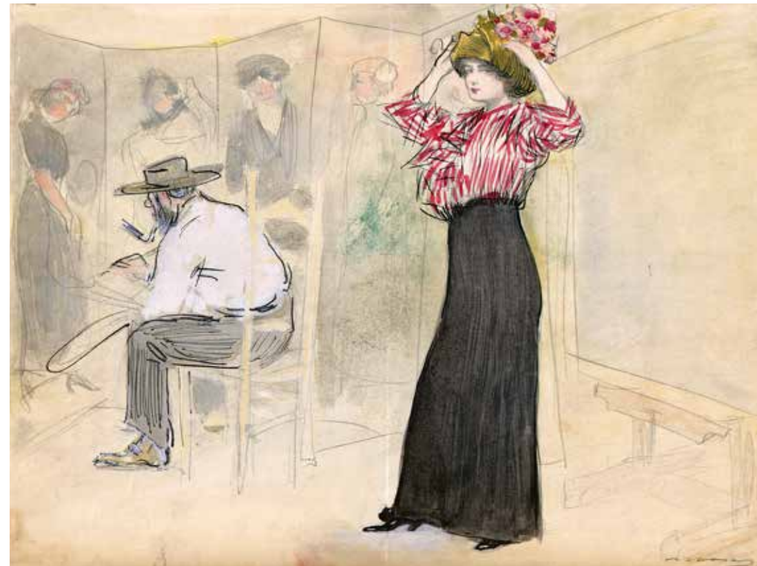
Fig. 9. This scene is part of an album of Ramon Casas’ drawings that belonged to Charles Deering. This notebook is an example of the artist’s habit of setting down those events and news that were worth highlighting, preferably using images rather than written chronicles.

The title La Sargantain no doubt comes from the frenchification of a Catalan word “sargantana” [lizard], as the work appeared with that exact title: La Sargantana , in the Catalan version of the magazine Forma . Its reproduction in this publication, published by Utrillo and Casas, also has the peculiarity of showing the work unfinished, still unsigned