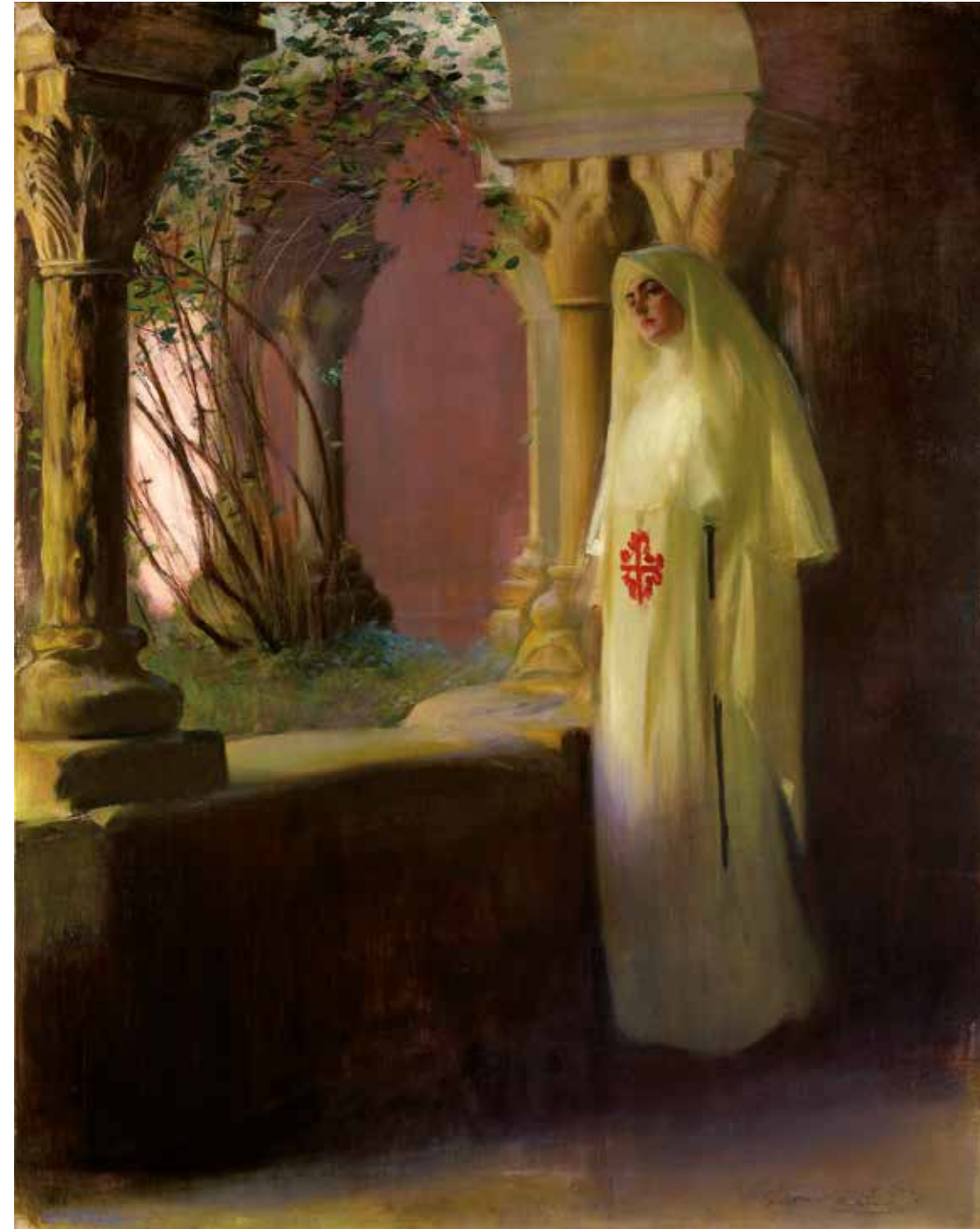
Fig. 20. An example of the series of six canvasses painted by Casas depicting Júlia in different parts of the Monastery of Sant Benet de Bages, dressed as a nun from the Order of Calatrava. This work appeared in the Casas-Clarasó-Rusiñol exhibition in the Sala Parés held in January 1915.

..... Sketch for the Floral Games of Barcelona poster. Charcoal and pastel on paper, c. 1908.