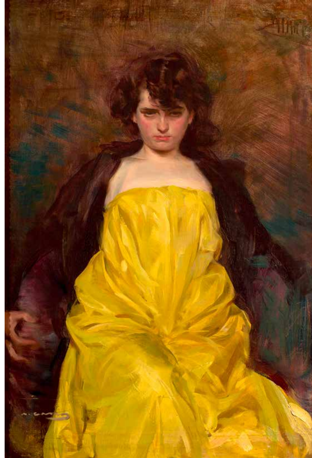
Fig. 11. The oil painting La Sargantain , shown here, was exhibited in the 5th International Art Exhibition of Barcelona and purchased by the Cercle del Liceu in Barcelona, where it still hangs in one of the rooms. The upper and lower sections of the painting, which did not form part of Casas’ final version and were folded back, were recovered in 1986 during restoration of the work, unfolding and incorporating them into the picture.

..... Photograph published in Forma , July 1907.