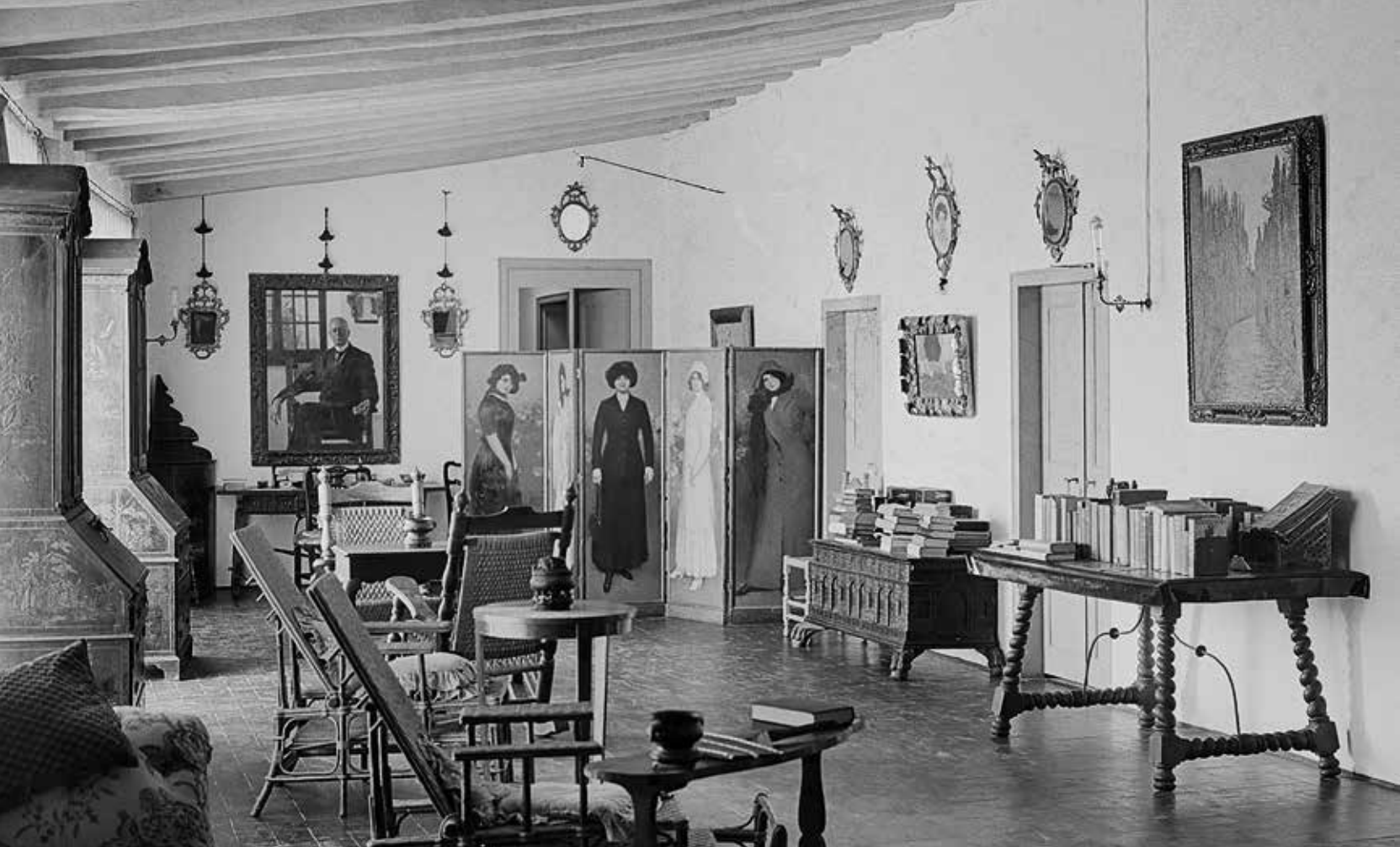
Fig. 8. The “Five Júlias” Folding Screen originally decorated the room in the Maricel Palace in Sitges, shown here. It comprised five hinged screens, each decorated with a portrait of Júlia representing different countries: Italy, Spain, France, England and America. The paintings, separated from the whole piece, are currently found in different collections.

[Júlia reading] (private collection), and in another for the Álbum de Pintores Catalanes Dedicado a Alfonso XIII [Album of Catalan painters for Alfonso XIII], where some originals were hastily gathered together as a gift for the King upon his marriage to Victoria Eugenia of Battenberg.