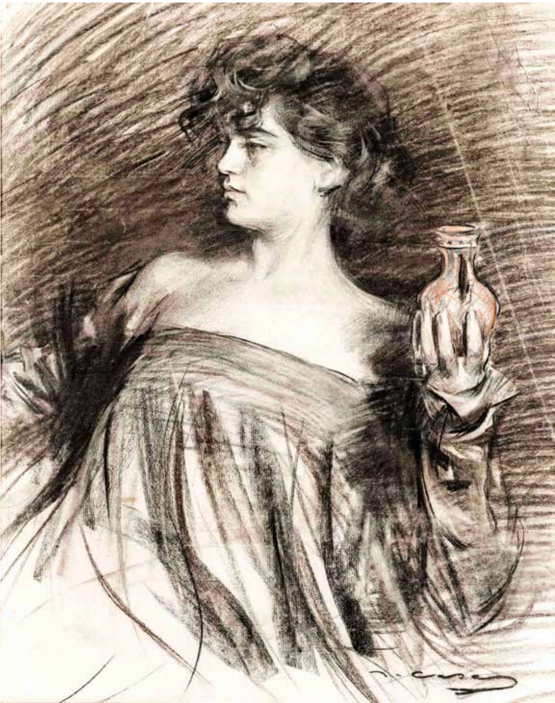
Fig. 5. Here we see a drawing used as a promotional card for Fayans Català, an establishment that began selling ceramics before expanding its business until advertising as “parfumerie aux fleurs”.

“Perhaps the contrast between Casas’ good period and bad period appears too significantly [in the biography by Alberto del Castillo]. Perhaps, if we wish to be profoundly fair, we should no longer talk of this contrast. Also, everybody has insisted on reminding us that