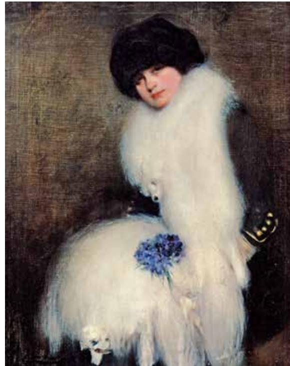
Figs. 12-13. Women dressed in fox or ermine furs, as seen here, are often seen in Casas’ portraits.