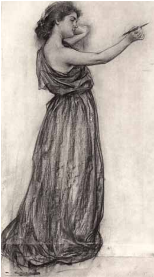
Figs. 21-22. Here we see Júlia in a preliminary sketch by Casas. The adjacent page shows the drawing applied to a printed advertising postcard for the Espasa Encyclopaedia.