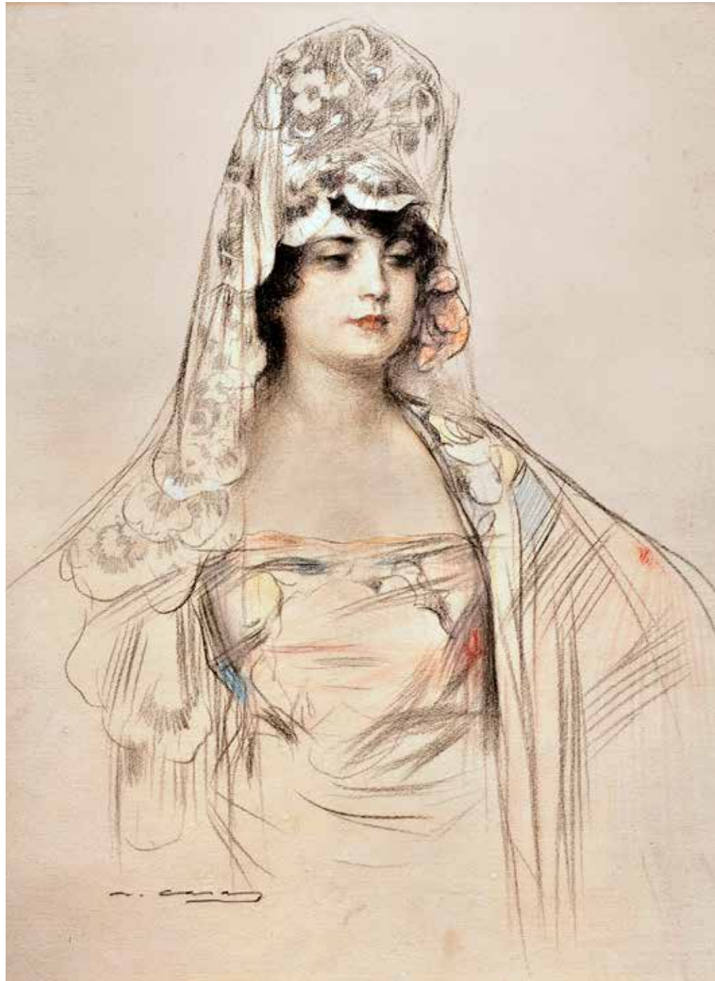
Fig. 16. Here is an example of the great variety of folkloric Júlias that Casas depicted, dressed in mantillas, shawls, combs, fans, and many of them wearing a flower in her hair.